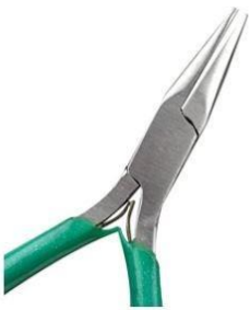
Needle nose pliers