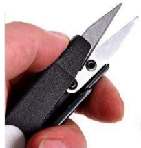
Multipurpose detail snips