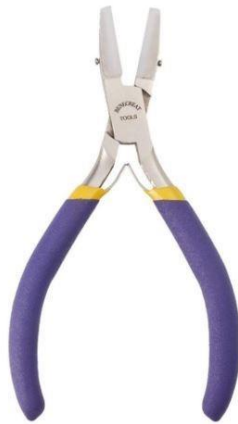
Nylon tipped pliers